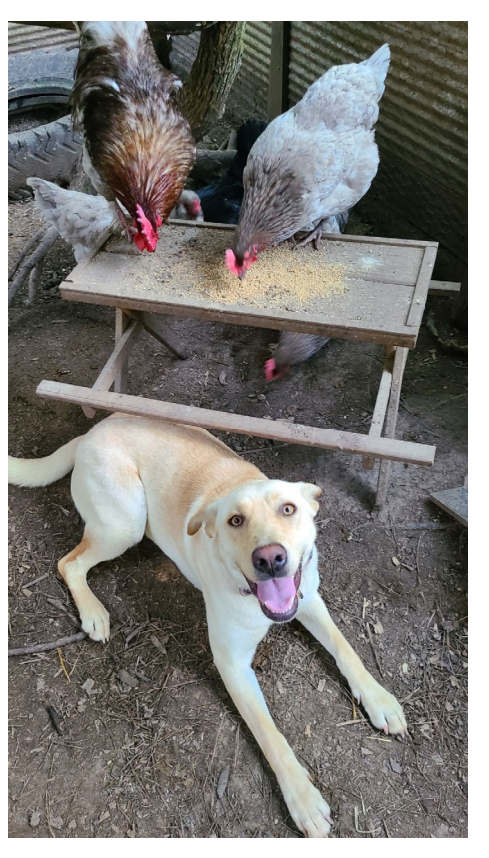
2022 Farm Dog of the Year/Lucy