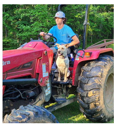
2022 Farm Dog of the Year/Lucy

By submitting a photo/video, I hereby grant Mississippi Farm Bureau® Federation (MFBF) the right to use the photo/video entry for publishing, illustration, advertising, trade and promotion, or any other use in any medium for any purpose of MFBF. I hold MFBF harmless from any and all liability that might arise out of or result from the foregoing use. My entry signifies that I will abide by all rules.